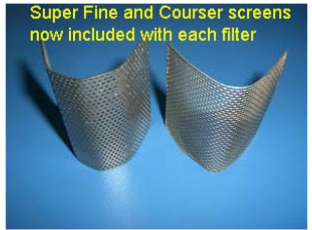
When first fitted, check regularly for debris until minimal amounts are trapped.

If you have any questions regarding Tefba filters or any other XJS related product, please email brian@fasterjags.com or call Brian Welker at 214-769-4555.